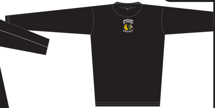
COMPRESSION CREW NECK