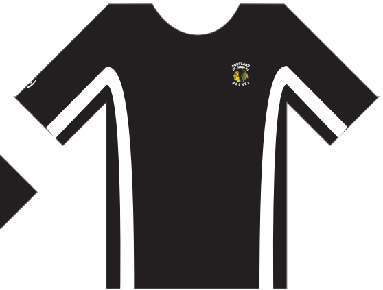
SHOOTER SHIRT -Moisture-wicking, high-performance 100% polyester, crew neck collar, pique mesh design, accent stripes down the sides; Sizes S-XXL $27.75

HARROW SPORTS, INC. 600 WEST BAYAUD AVE. DENVER, CO 80223