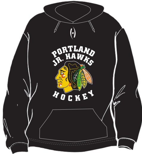
HOODED SWEATSHIRT -10 oz., 80/20 cotton/polyester., Lycra reinforced 2x1 fashion rib; Sizes: YS-XXXL $31.75