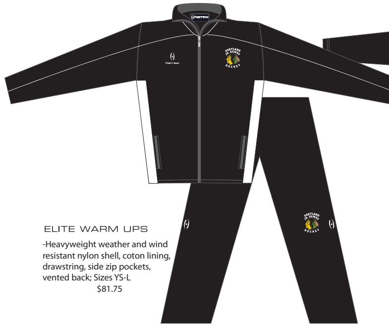
ELITE WARM UPS -Heavyweight weather and wind resistant nylon shell, cotton lining, drawstring, side zip pockets, vented back; Sizes YS-L $81.75