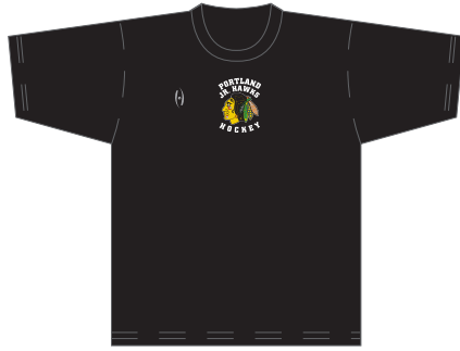
BASE LAYER SHIRT -Moisture Wicking Base-Layer - Anti-Microbial - 88% Poly, 12% Spandex ; Sizes YL-XXL (sizes run small) $27.75