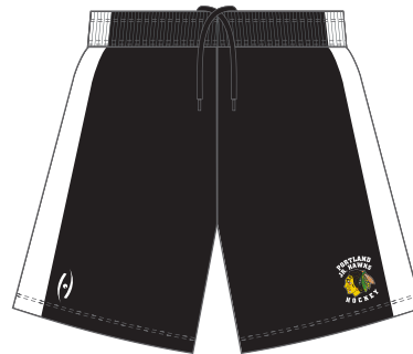
TRIUMPH SHORTS -2 Ply Tricot Mesh, 7" Inseam, 3" Side Panel, Elastic waistband, Drawstring, Contrasting Side Panel; Sizes YS/M-XXL (sizes run small) $21.75